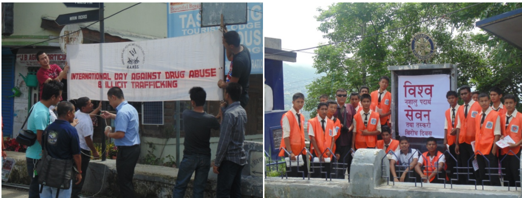
Staff, volunteers, Patients & NSS Cadets at ground zero

The primary motive of commemorating this international day is to be able to reach out to the masses in order to educate them about the disease of chemical dependency and its solutions. Though UNODC, still maintained the same slogan this year “Make Health your Fashion not Drugs” HANDS had a very practical message for the people this year which stated “Save Lives, Observe Anti Drugs Day Every Day” which were printed in stickers. The committee members, staff, volunteers and most importantly NSS Cadets of SUMI School gathered in the heart of Kalimpong Town and started pasting stickers in various private and commercial establishments and vehicles but not before consuming five minutes of their time in making them aware of the day and its cause. Very soon Kalimpong town was painted with our stickers which helped promote the message of this significant day