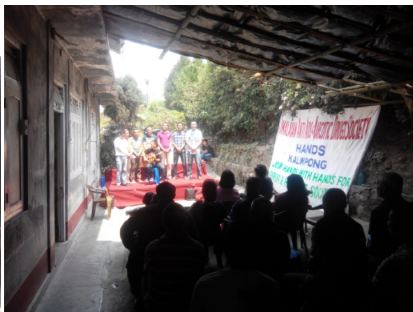
Committee members, Guests and Patients watching the program

The Patients, Staff, Board Members and families celebrated 5 yrs of successfully saving lives n bringing happiness in the society by the services rendered by HANDS Rehab on Monday 14th April 2014. Patients performed with all enthusiasm, group songs and folk dances which ended with a love feast.