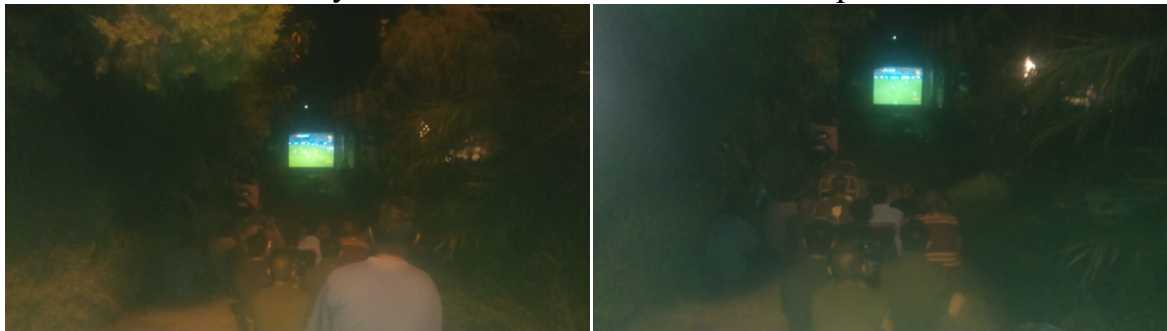
Staff and Patients enjoying the match

With the intent of teaching the patients mainstream fancies and enjoyment without the use of chemicals, HANDS had organized a very lively atmosphere in the finals of FIFA World Cup by projecting the entire match in an LCD projector along with lot of refreshments.