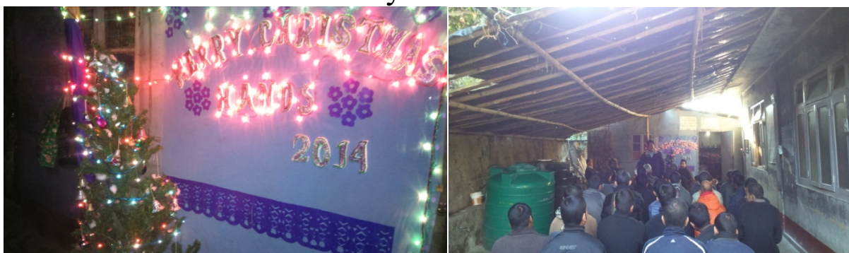
Lights at the centre for the celebrations