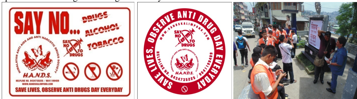
Life Saver stickers which painted Kalimpong town Red

The primary motive of commemorating this international day is to be able to reach out to the masses in order to educate them about the disease of chemical dependency and its solutions. Though UNODC, still maintained the same slogan this year “Make Health your Fashion not Drugs” HANDS had a very practical message for the people this year which stated “Save Lives, Observe Anti Drugs Day Every Day” which were printed in stickers. The committee members, staff, volunteers and most importantly NSS Cadets of SUMI School gathered in the heart of Kalimpong Town and started pasting stickers in various private and commercial establishments and vehicles but not before consuming five minutes of their time in making them aware of the day and its cause. Very soon Kalimpong town was painted with our stickers which helped promote the message of this significant day