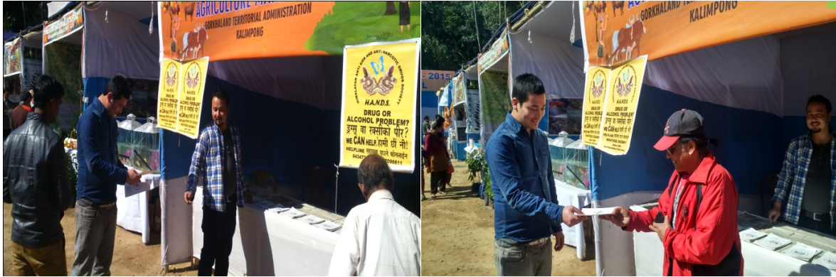
Staff and resource persons of HANDS interacting with the public

Like every year the regional administration, GTA ,Gorkhaland Territorial Administration had organized a mala for the farmers of Kalimpong Subdivision. As substance abuse, specially Alcohol is an accepted vice in the society and is one of the major factors in producing downward growth among the masses. Hence GTA has rightfully identified this factor and involved HANDS in order to make the farmers of this social evil.